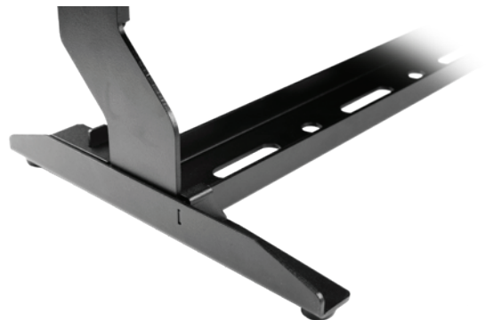
Optional Linear Attachable Feet available