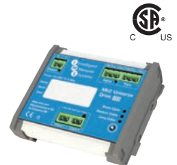
Universe Drive DIN Rail

Innovative, Performance-Driven Show Technology Since 1983