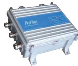
IP65 Universe Drive