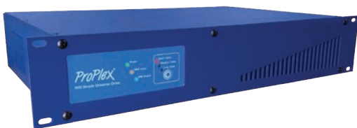
Simple Universe Drive