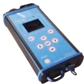
Hand Held Programmer